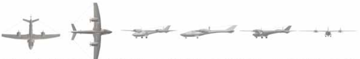
DVI-AirCon05_023 DVI-AirCon05_024 DVI-AirCon05g_000 DVI-AirCon05g_001 DVI-AirCon05g_002 DVI-AirCon05g_003