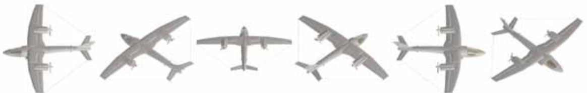
DVI-AirCon05_017 DVI-AirCon05_018 DVI-AirCon05_019 DVI-AirCon05_020 DVI-AirCon05_021 DVI-AirCon05_022