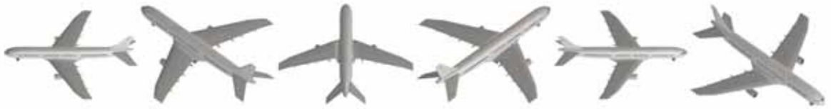
DVI-AirCon01g_017 DVI-AirCon01g_018 DVI-AirCon01g_019 DVI-AirCon01g_020 DVI-AirCon01g_021 DVI-AirCon01g_022