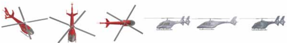
DVI-AirCon12_022 DVI-AirCon12_023 DVI-AirCon12_024 DVI-AirCon13_000 DVI-AirCon13_001 DVI-AirCon13_002