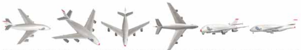
DVI-AirCon06_021 DVI-AirCon06_022 DVI-AirCon06_023 DVI-AirCon06_024 DVI-AirCon06g_000 DVI-AirCon06g_001