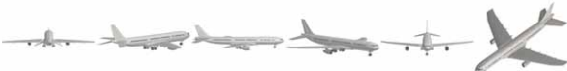
DVI-AirCon01g_011 DVI-AirCon01g_012 DVI-AirCon01g_013 DVI-AirCon01g_014 DVI-AirCon01g_015 DVI-AirCon01g_016