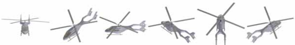
DVI-AirCon13_015 DVI-AirCon13_016 DVI-AirCon13_017 DVI-AirCon13_018 DVI-AirCon13_019 DVI-AirCon13_020