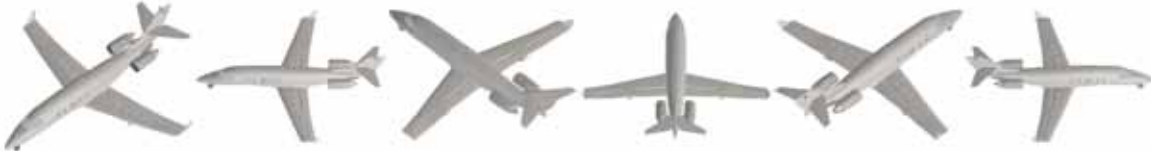
DVI-AirCon08g_016 DVI-AirCon08g_017 DVI-AirCon08g_018 DVI-AirCon08g_019 DVI-AirCon08g_020 DVI-AirCon08g_021