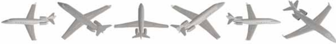
DVI-AirCon08_017 DVI-AirCon08_018 DVI-AirCon08_019 DVI-AirCon08_020 DVI-AirCon08_021 DVI-AirCon08_022