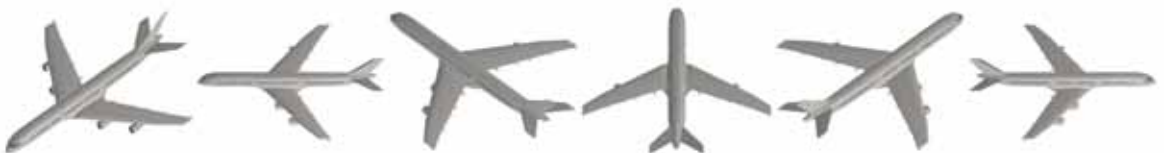
DVI-AirCon02_016 DVI-AirCon02_017 DVI-AirCon02_018 DVI-AirCon02_019 DVI-AirCon02_020 DVI-AirCon02_021