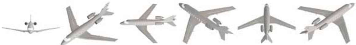
DVI-AirCon09_015 DVI-AirCon09_016 DVI-AirCon09_017 DVI-AirCon09_018 DVI-AirCon09_019 DVI-AirCon09_020