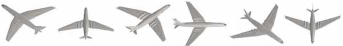
DVI-AirCon20_018 DVI-AirCon20_019 DVI-AirCon20_020 DVI-AirCon20_021 DVI-AirCon20_022 DVI-AirCon20_023