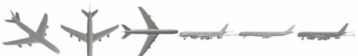
DVI-AirCon02_022 DVI-AirCon02_023 DVI-AirCon02_024 DVI-AirCon02g_000 DVI-AirCon02g_001 DVI-AirCon02g_002