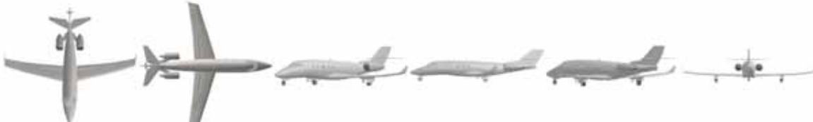
DVI-AirCon08_023 DVI-AirCon08_024 DVI-AirCon08g_000 DVI-AirCon08g_001 DVI-AirCon08g_002 DVI-AirCon08g_003