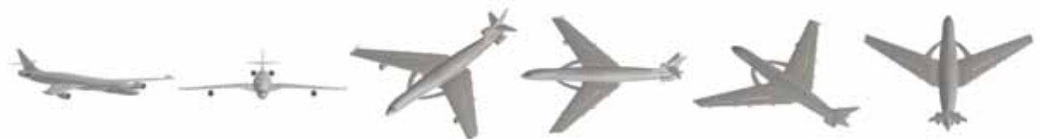
DVI-AirCon03_014 DVI-AirCon03_015 DVI-AirCon03_016 DVI-AirCon03_017 DVI-AirCon03_018 DVI-AirCon03_019