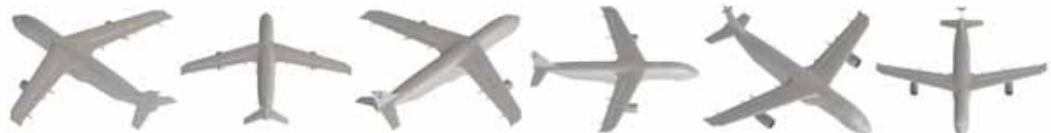
DVI-AirCon07g_018 DVI-AirCon07g_019 DVI-AirCon07g_020 DVI-AirCon07g_021 DVI-AirCon07g_022 DVI-AirCon07g_023