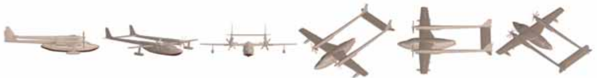
DVI-AirCon19_013 DVI-AirCon19_014 DVI-AirCon19_015 DVI-AirCon19_016 DVI-AirCon19_017 DVI-AirCon19_018