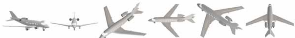
DVI-AirCon09g_014 DVI-AirCon09g_015 DVI-AirCon09g_016 DVI-AirCon09g_017 DVI-AirCon09g_018 DVI-AirCon09g_019