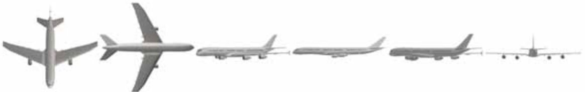
DVI-AirCon01g_023 DVI-AirCon01g_024 DVI-AirCon02_000 DVI-AirCon02_001 DVI-AirCon02_002 DVI-AirCon02_003