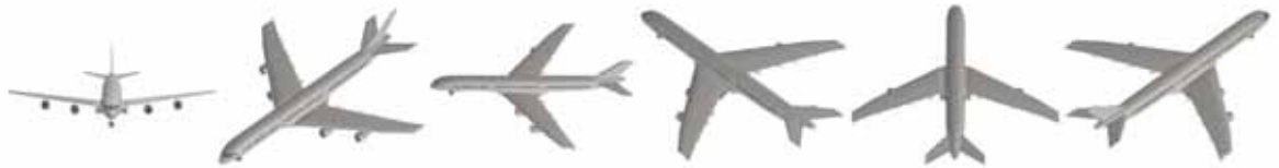
DVI-AirCon02g_015 DVI-AirCon02g_016 DVI-AirCon02g_017 DVI-AirCon02g_018 DVI-AirCon02g_019 DVI-AirCon02g_020