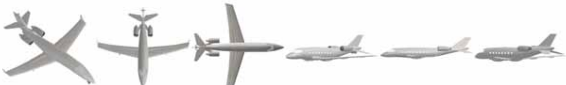
DVI-AirCon08g_022 DVI-AirCon08g_023 DVI-AirCon08g_024 DVI-AirCon09_000 DVI-AirCon09_001 DVI-AirCon09_002