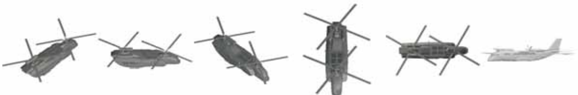
DVI-AirCon14_020 DVI-AirCon14_021 DVI-AirCon14_022 DVI-AirCon14_023 DVI-AirCon14_024 DVI-AirCon15_000