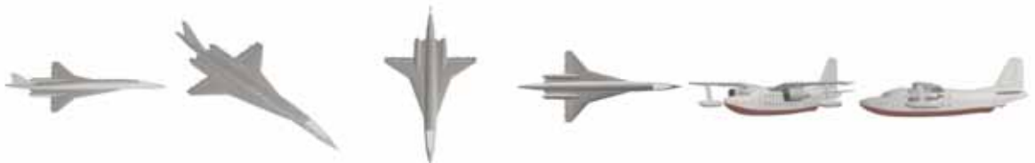
DVI-AirCon17_021 DVI-AirCon17_022 DVI-AirCon17_023 DVI-AirCon17_024 DVI-AirCon18_000 DVI-AirCon18_001