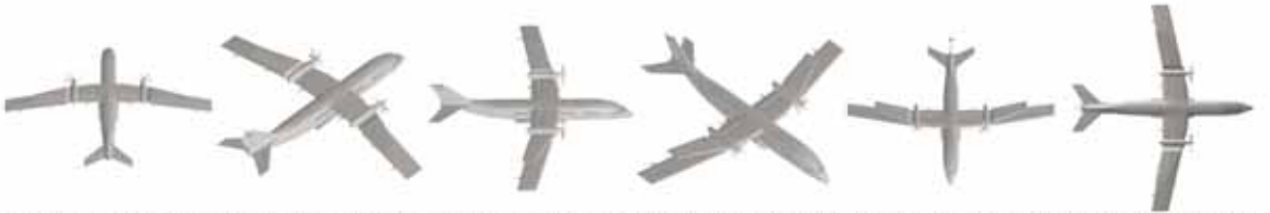
DVI-AirCon15_019 DVI-AirCon15_020 DVI-AirCon15_021 DVI-AirCon15_022 DVI-AirCon15_023 DVI-AirCon15_024