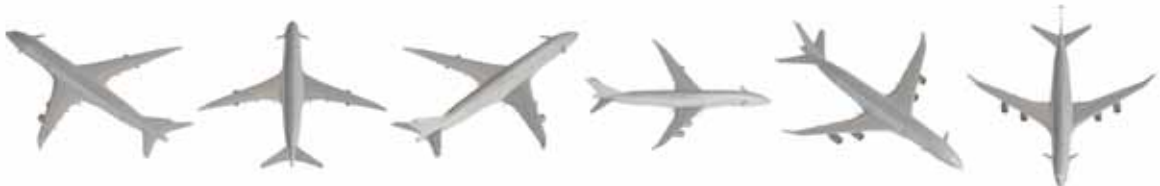
DVI-AirCon11_018 DVI-AirCon11_019 DVI-AirCon11_020 DVI-AirCon11_021 DVI-AirCon11_022 DVI-AirCon11_023