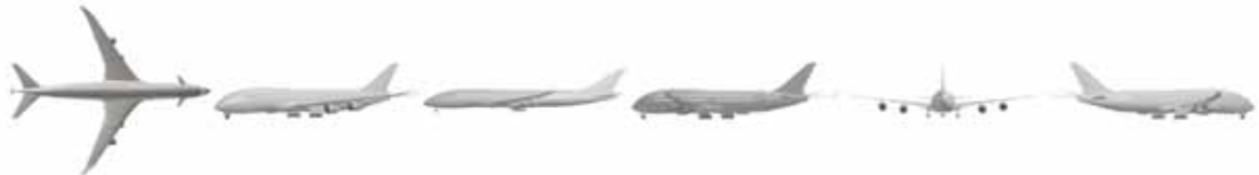
DVI-AirCon11_024 DVI-AirCon11g_000 DVI-AirCon11g_001 DVI-AirCon11g_002 DVI-AirCon11g_003 DVI-AirCon11g_004