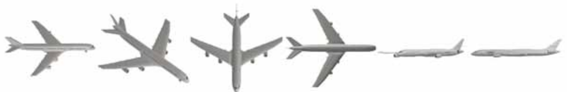
DVI-AirCon02g_021 DVI-AirCon02g_022 DVI-AirCon02g_023 DVI-AirCon02g_024 DVI-AirCon03_000 DVI-AirCon03_001