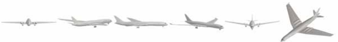
DVI-AirCon20g_011 DVI-AirCon20g_012 DVI-AirCon20g_013 DVI-AirCon20g_014 DVI-AirCon20g_015 DVI-AirCon20g_016