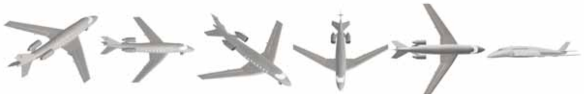
DVI-AirCon09g_020 DVI-AirCon09g_021 DVI-AirCon09g_022 DVI-AirCon09g_023 DVI-AirCon09g_024 DVI-AirCon10_000