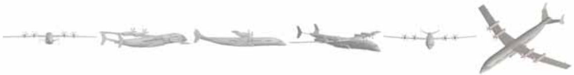
DVI-AirCon16_011 DVI-AirCon16_012 DVI-AirCon16_013 DVI-AirCon16_014 DVI-AirCon16_015 DVI-AirCon16_016