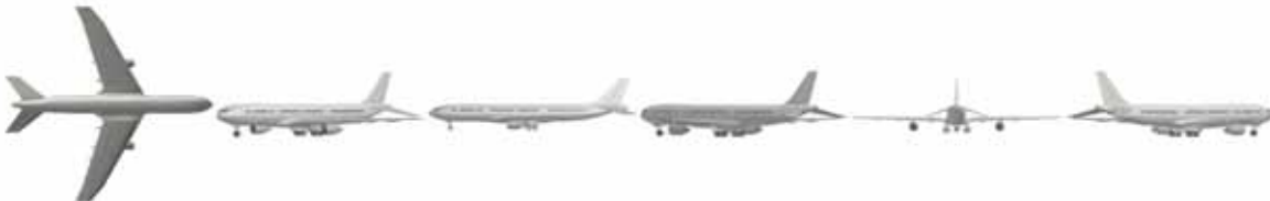
DVI-AirCon01_024 DVI-AirCon01g_000 DVI-AirCon01g_001 DVI-AirCon01g_002 DVI-AirCon01g_003 DVI-AirCon01g_004