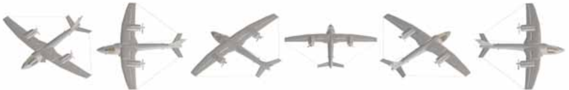
DVI-AirCon05g_016 DVI-AirCon05g_017 DVI-AirCon05g_018 DVI-AirCon05g_019 DVI-AirCon05g_020 DVI-AirCon05g_021