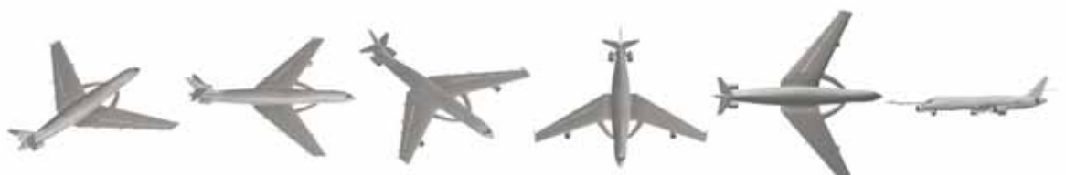
DVI-AirCon03_020 DVI-AirCon03_021 DVI-AirCon03_022 DVI-AirCon03_023 DVI-AirCon03_024 DVI-AirCon03g_000