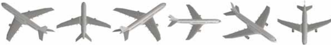
DVI-AirCon01_018 DVI-AirCon01_019 DVI-AirCon01_020 DVI-AirCon01_021 DVI-AirCon01_022 DVI-AirCon01_023