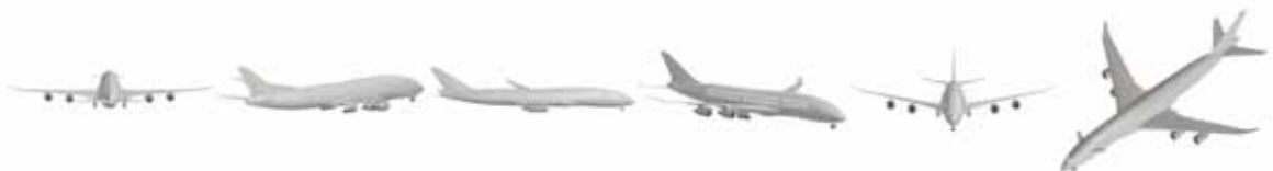
DVI-AirCon11g_011 DVI-AirCon11g_012 DVI-AirCon11g_013 DVI-AirCon11g_014 DVI-AirCon11g_015 DVI-AirCon11g_016