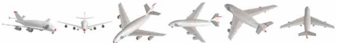
DVI-AirCon06g_014 DVI-AirCon06g_015 DVI-AirCon06g_016 DVI-AirCon06g_017 DVI-AirCon06g_018 DVI-AirCon06g_019