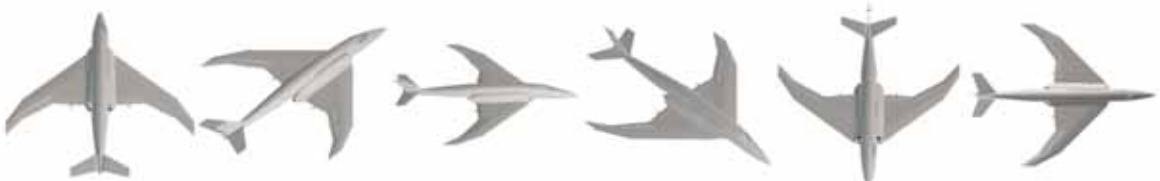
DVI-AirCon10_019 DVI-AirCon10_020 DVI-AirCon10_021 DVI-AirCon10_022 DVI-AirCon10_023 DVI-AirCon10_024