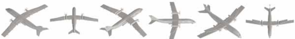
DVI-AirCon15g_018 DVI-AirCon15g_019 DVI-AirCon15g_020 DVI-AirCon15g_021 DVI-AirCon15g_022 DVI-AirCon15g_023