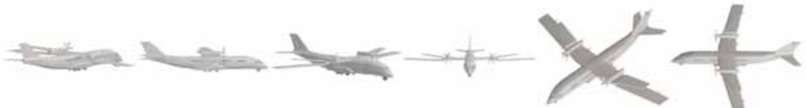
DVI-AirCon15g_012 DVI-AirCon15g_013 DVI-AirCon15g_014 DVI-AirCon15g_015 DVI-AirCon15g_016 DVI-AirCon15g_017