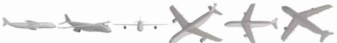
DVI-AirCon07_013 DVI-AirCon07_014 DVI-AirCon07_015 DVI-AirCon07_016 DVI-AirCon07_017 DVI-AirCon07_018