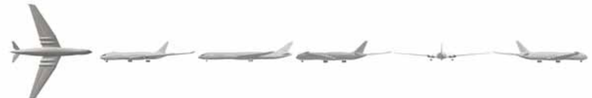
DVI-AirCon20_024 DVI-AirCon20g_000 DVI-AirCon20g_001 DVI-AirCon20g_002 DVI-AirCon20g_003 DVI-AirCon20g_004