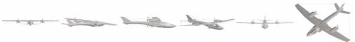
DVI-AirCon05_011 DVI-AirCon05_012 DVI-AirCon05_013 DVI-AirCon05_014 DVI-AirCon05_015 DVI-AirCon05_016