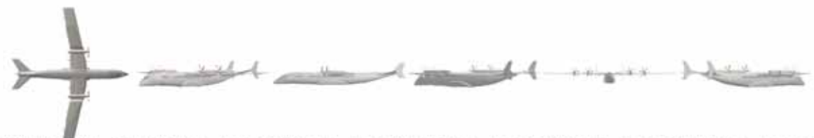
DVI-AirCon15g_024 DVI-AirCon16_000 DVI-AirCon16_001 DVI-AirCon16_002 DVI-AirCon16_003 DVI-AirCon16_004