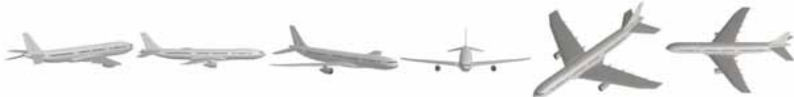
DVI-AirCon01_012 DVI-AirCon01_013 DVI-AirCon01_014 DVI-AirCon01_015 DVI-AirCon01_016 DVI-AirCon01_017