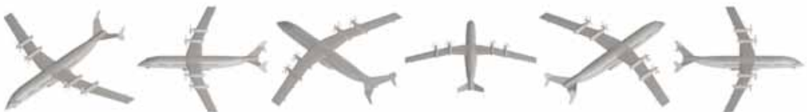
DVI-AirCon16g_016 DVI-AirCon16g_017 DVI-AirCon16g_018 DVI-AirCon16g_019 DVI-AirCon16g_020 DVI-AirCon16g_021