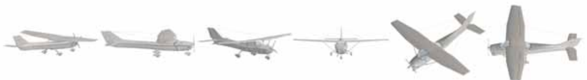
DVI-AirCon04_012 DVI-AirCon04_013 DVI-AirCon04_014 DVI-AirCon04_015 DVI-AirCon04_016 DVI-AirCon04_017