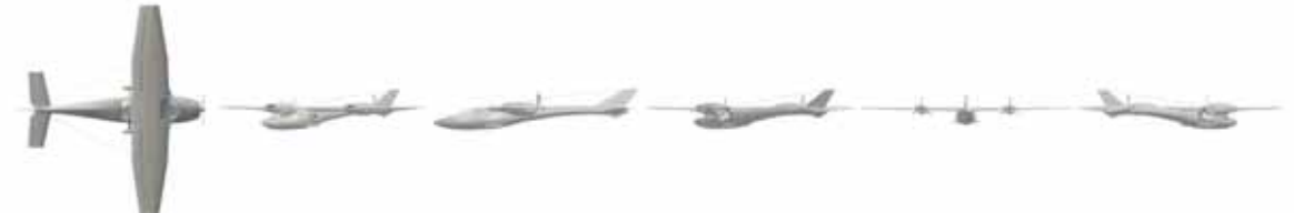
DVI-AirCon04_024 DVI-AirCon05_000 DVI-AirCon05_001 DVI-AirCon05_002 DVI-AirCon05_003 DVI-AirCon05_004