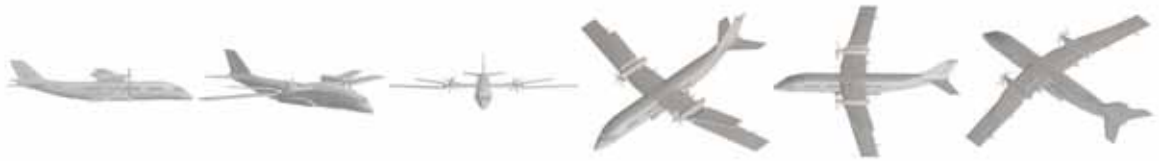
DVI-AirCon15_013 DVI-AirCon15_014 DVI-AirCon15_015 DVI-AirCon15_016 DVI-AirCon15_017 DVI-AirCon15_018