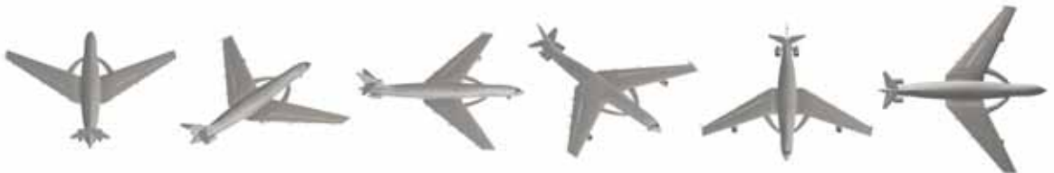
DVI-AirCon03g_019 DVI-AirCon03g_020 DVI-AirCon03g_021 DVI-AirCon03g_022 DVI-AirCon03g_023 DVI-AirCon03g_024