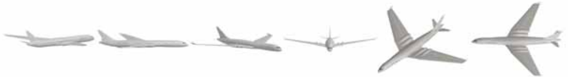
DVI-AirCon20_012 DVI-AirCon20_013 DVI-AirCon20_014 DVI-AirCon20_015 DVI-AirCon20_016 DVI-AirCon20_017