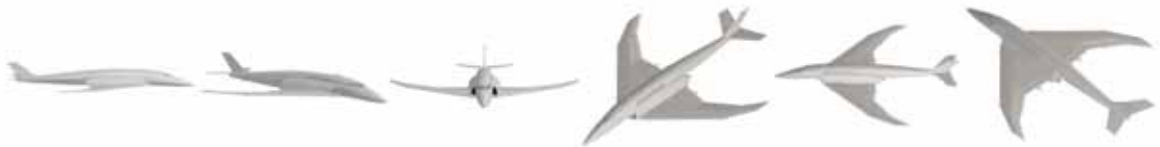
DVI-AirCon10_013 DVI-AirCon10_014 DVI-AirCon10_015 DVI-AirCon10_016 DVI-AirCon10_017 DVI-AirCon10_018