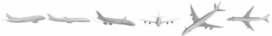
DVI-AirCon11_012 DVI-AirCon11_013 DVI-AirCon11_014 DVI-AirCon11_015 DVI-AirCon11_016 DVI-AirCon11_017