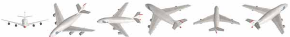
DVI-AirCon06_015 DVI-AirCon06_016 DVI-AirCon06_017 DVI-AirCon06_018 DVI-AirCon06_019 DVI-AirCon06_020