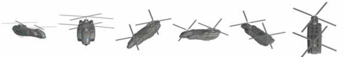
DVI-AirCon14_014 DVI-AirCon14_015 DVI-AirCon14_016 DVI-AirCon14_017 DVI-AirCon14_018 DVI-AirCon14_019