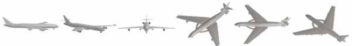
DVI-AirCon03g_013 DVI-AirCon03g_014 DVI-AirCon03g_015 DVI-AirCon03g_016 DVI-AirCon03g_017 DVI-AirCon03g_018