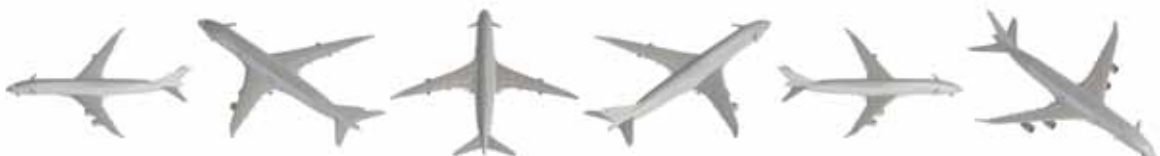
DVI-AirCon11g_017 DVI-AirCon11g_018 DVI-AirCon11g_019 DVI-AirCon11g_020 DVI-AirCon11g_021 DVI-AirCon11g_022