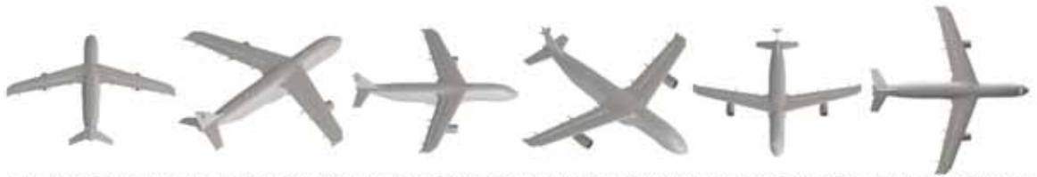
DVI-AirCon07_019 DVI-AirCon07_020 DVI-AirCon07_021 DVI-AirCon07_022 DVI-AirCon07_023 DVI-AirCon07_024