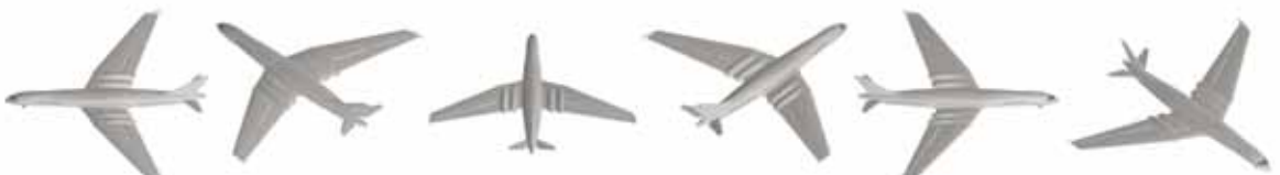
DVI-AirCon20g_017 DVI-AirCon20g_018 DVI-AirCon20g_019 DVI-AirCon20g_020 DVI-AirCon20g_021 DVI-AirCon20g_022