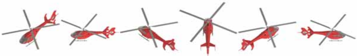
DVI-AirCon12_016 DVI-AirCon12_017 DVI-AirCon12_018 DVI-AirCon12_019 DVI-AirCon12_020 DVI-AirCon12_021