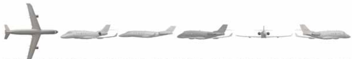
DVI-AirCon07g_024 DVI-AirCon08_000 DVI-AirCon08_001 DVI-AirCon08_002 DVI-AirCon08_003 DVI-AirCon08_004