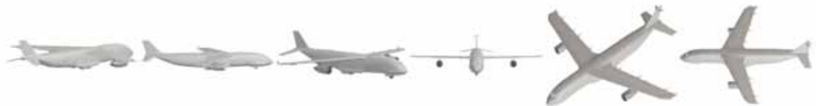
DVI-AirCon07g_012 DVI-AirCon07g_013 DVI-AirCon07g_014 DVI-AirCon07g_015 DVI-AirCon07g_016 DVI-AirCon07g_017