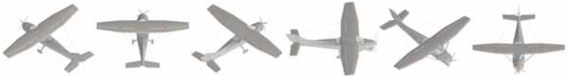
DVI-AirCon04_018 DVI-AirCon04_019 DVI-AirCon04_020 DVI-AirCon04_021 DVI-AirCon04_022 DVI-AirCon04_023