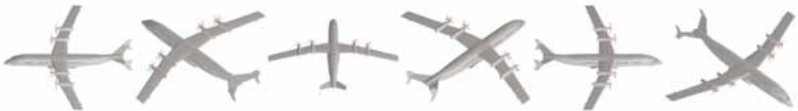
DVI-AirCon16_017 DVI-AirCon16_018 DVI-AirCon16_019 DVI-AirCon16_020 DVI-AirCon16_021 DVI-AirCon16_022