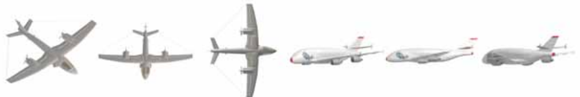
DVI-AirCon05g_022 DVI-AirCon05g_023 DVI-AirCon05g_024 DVI-AirCon06_000 DVI-AirCon06_001 DVI-AirCon06_002