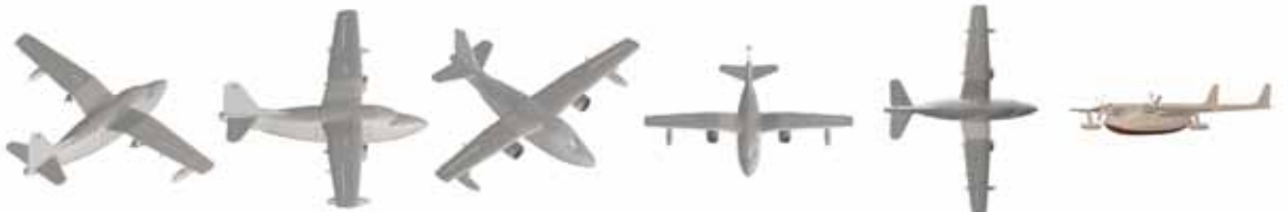
DVI-AirCon18_020 DVI-AirCon18_021 DVI-AirCon18_022 DVI-AirCon18_023 DVI-AirCon18_024 DVI-AirCon19_000