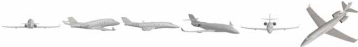
DVI-AirCon08_011 DVI-AirCon08_012 DVI-AirCon08_013 DVI-AirCon08_014 DVI-AirCon08_015 DVI-AirCon08_016