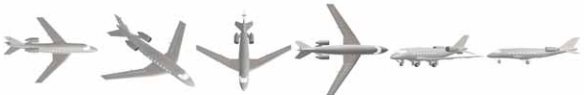
DVI-AirCon09_021 DVI-AirCon09_022 DVI-AirCon09_023 DVI-AirCon09_024 DVI-AirCon09g_000 DVI-AirCon09g_001