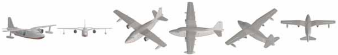
DVI-AirCon18_014 DVI-AirCon18_015 DVI-AirCon18_016 DVI-AirCon18_017 DVI-AirCon18_018 DVI-AirCon18_019