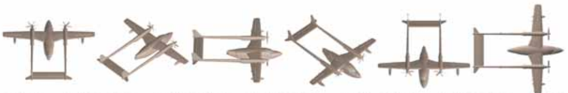
DVI-AirCon19_019 DVI-AirCon19_020 DVI-AirCon19_021 DVI-AirCon19_022 DVI-AirCon19_023 DVI-AirCon19_024