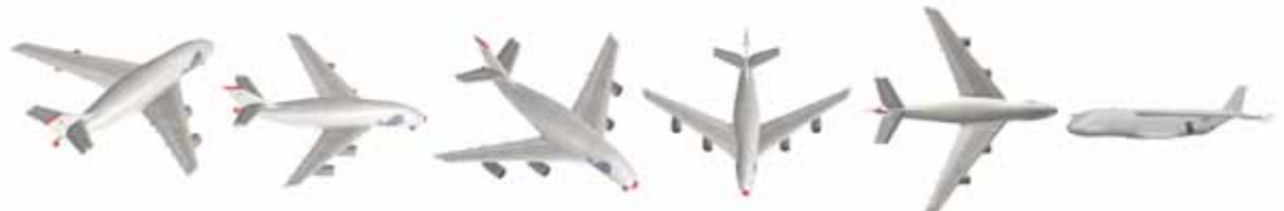
DVI-AirCon06g_020 DVI-AirCon06g_021 DVI-AirCon06g_022 DVI-AirCon06g_023 DVI-AirCon06g_024 DVI-AirCon07_000