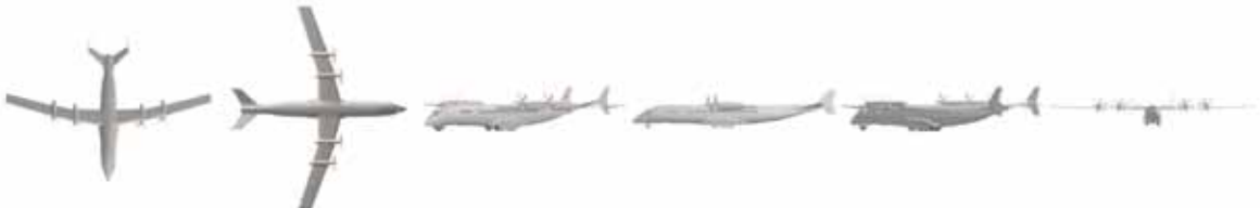
DVI-AirCon16_023 DVI-AirCon16_024 DVI-AirCon16g_000 DVI-AirCon16g_001 DVI-AirCon16g_002 DVI-AirCon16g_003